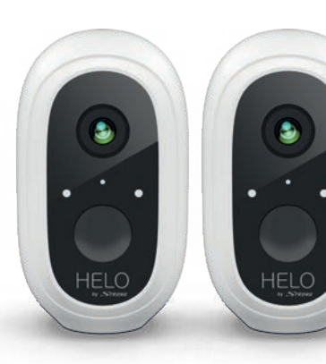
The initial kit contains 2 cameras. You can add up to 2 additional cameras. A base station can manage up to 4 cameras in your home.